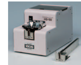
Models: HS-35 (M3.5) HS-40 (M4.0) HS-50 (M5.0)