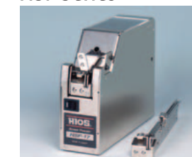
Models: HSF-10 (M1.0) HSF-20 (M2.0) HSF-12 (M1.2) HSF-26 (M2.6) HSF-14 (M1.4) HSF-30 (M3.0) HSF-17 (M1.7)