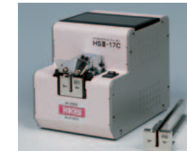
Models: HS III-10 (M1.0) HS III-20 (M2.0) HS III-12 (M1.2) HS III-23 (M2.3) HS III-14 (M1.4) HS III-26 (M2.6) HS III-17 (M1.7) HS III-30 (M3.0)