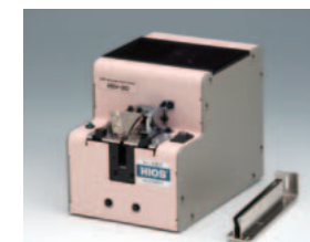
Models: HSV-10 (M1.0) HSV-20 (M2.0) HSV-12 (M1.2) HSV-23 (M2.3) HSV-14 (M1.4) HSV-26 (M2.6) HSV-17 (M1.7) HSV-30 (M3.0)