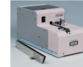
Models: HS-35RB (M3.5) HS-40RB (M4.0) HS-50RB (M5.0)