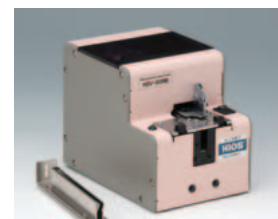
Models: HSV-10RB (M1.0) HSV-20RB (M2.0) HSV-12RB (M1.2) HSV-23RB (M2.3) HSV-14RB (M1.4) HSV-26RB (M2.6) HSV-17RB (M1.7) HSV-30RB (M3.0)